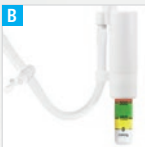
Hand inflator with colour coded pressure indicator

Double Hook Easy fixation of most fluid bag configurations